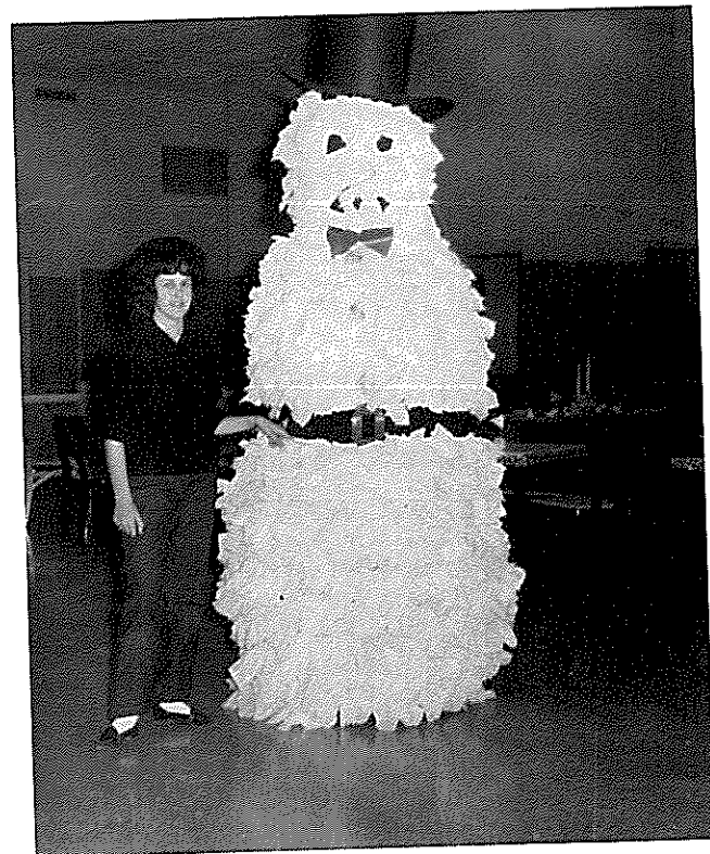
Poo pauses to pose with the snowman.