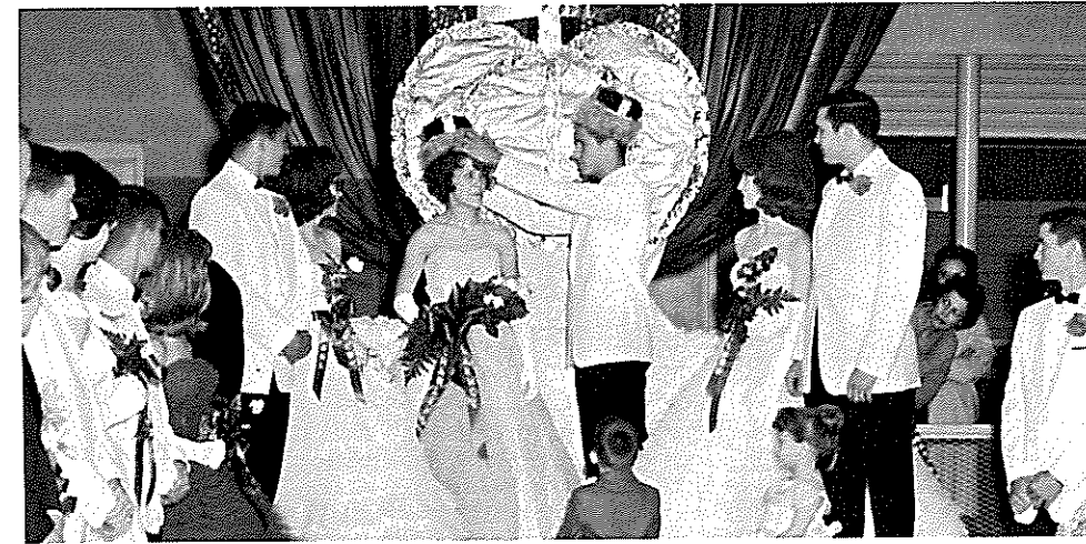
KHS Press Club sponsored the 14th annual Press Club Ball, February 8, 1964. Highlight of the Ball was the coronation of the king and queen and the presentation of the royal court.